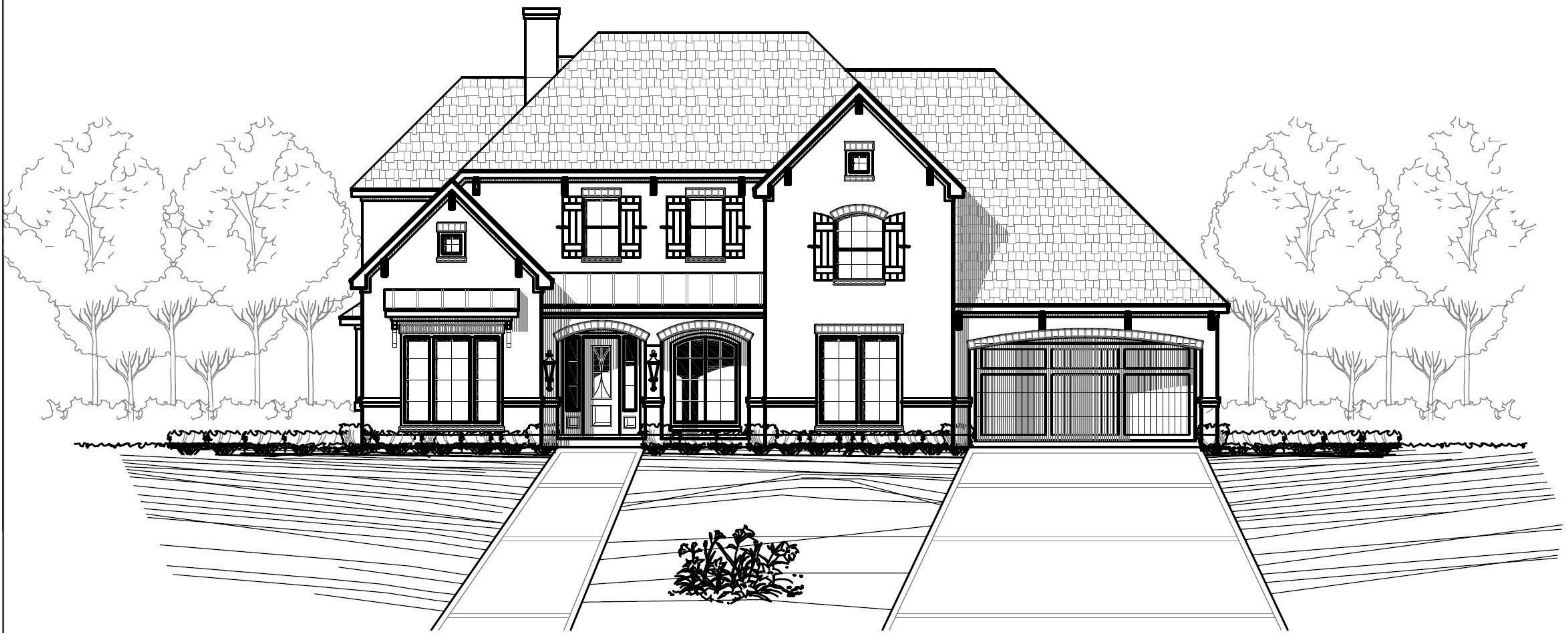
Front Elevation TRINITY ESTATE HOMES Plan No. 5579