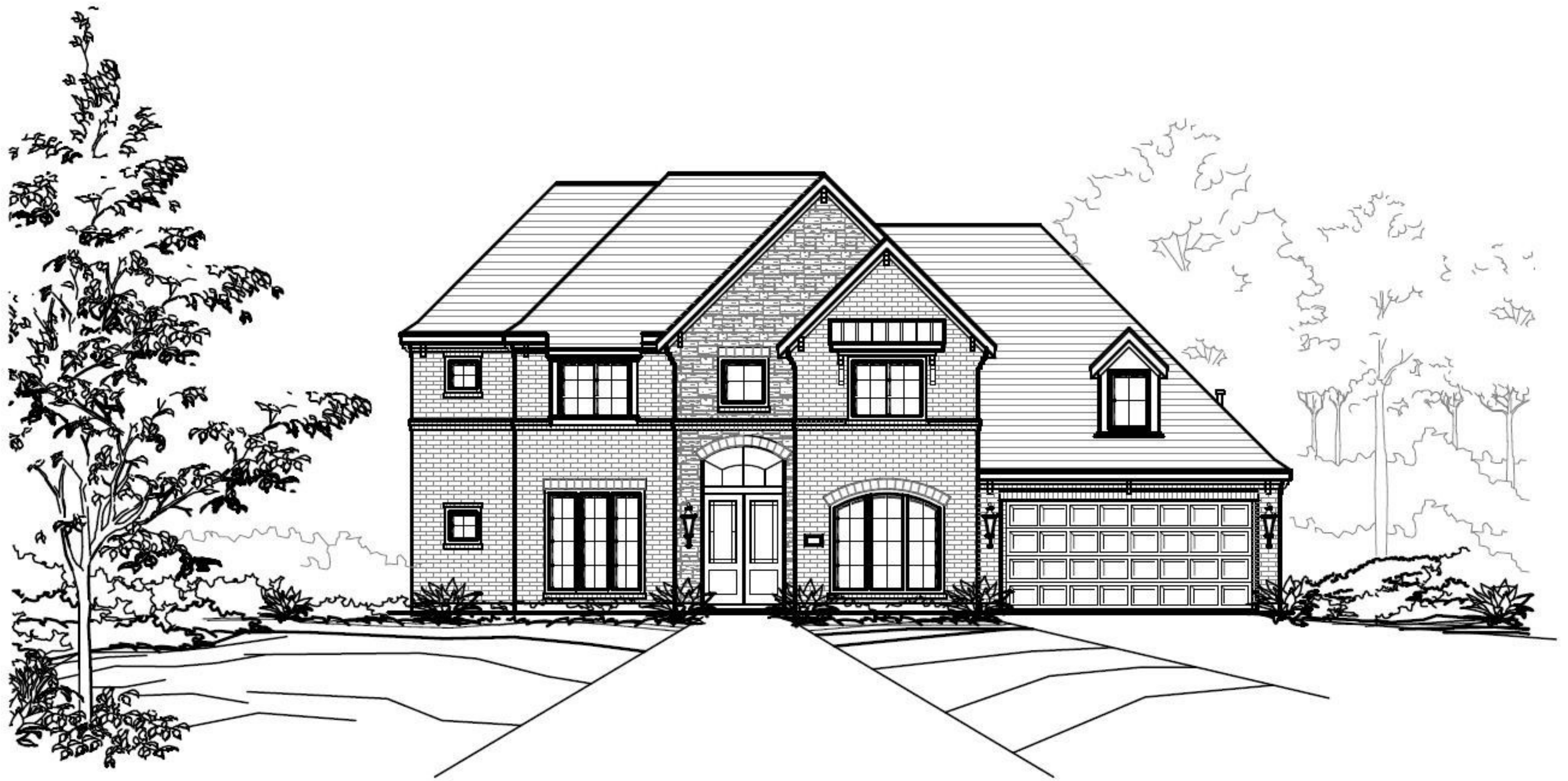
Front Elevation TRINITY ESTATE HOMES Plan No. 4470